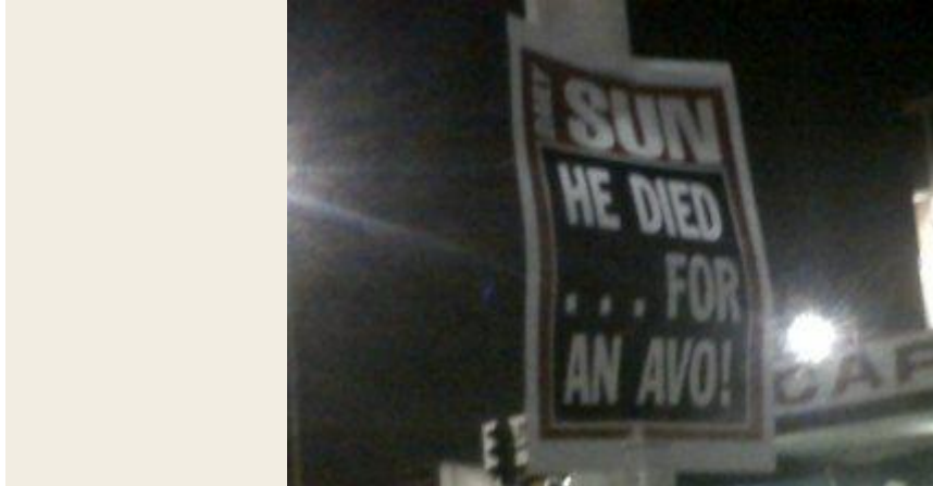
An example of the posters you will be required to write.

Applications can be emailed to baas.editor@dailysun.co.za and cc'd to the.tokoloshe@eish.com .